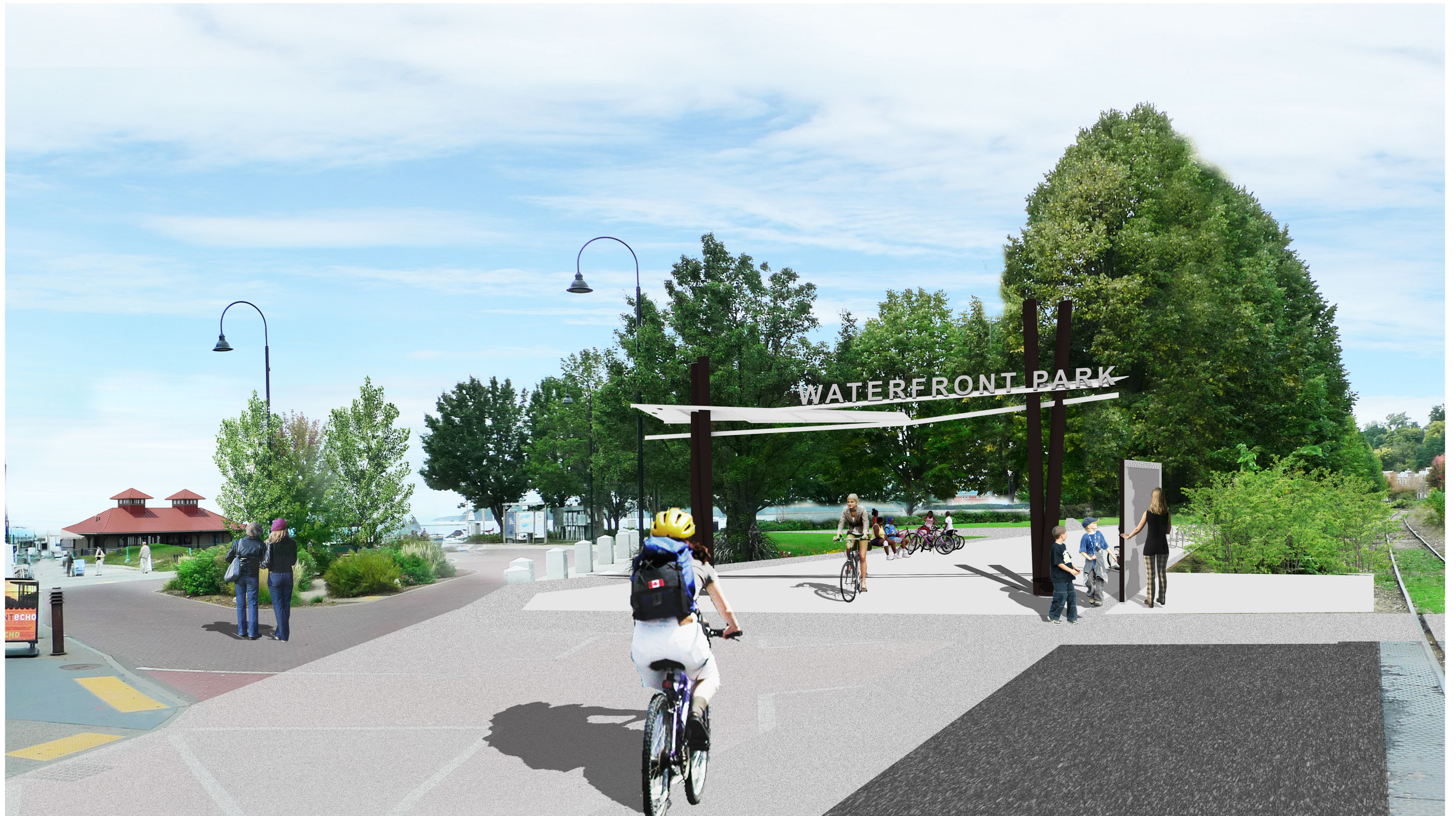
WATERFRONT PIAP PROJECT PROPOSAL WATERFRONT PARK UPGRADES View looking north at College Street