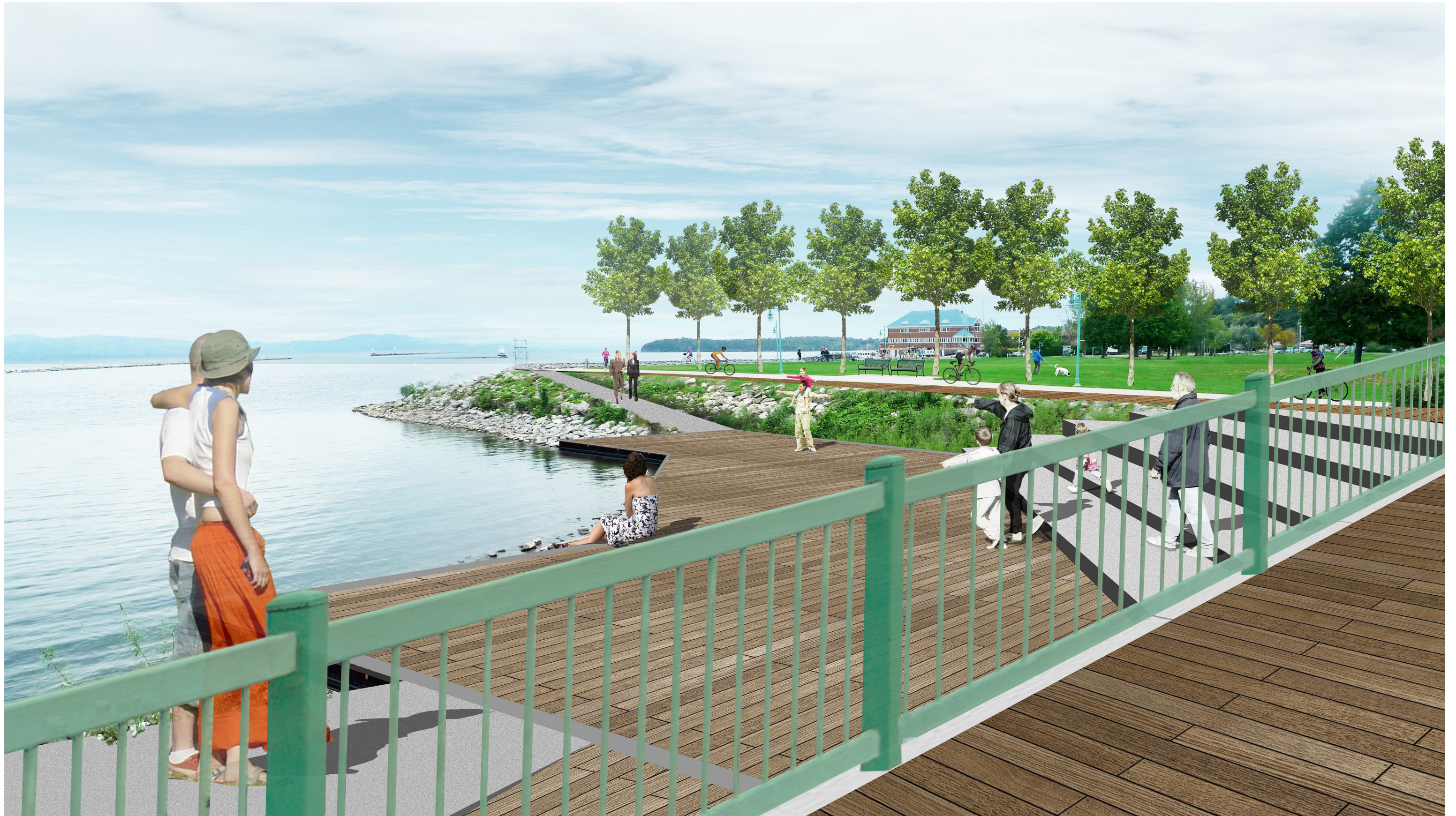
WATERFRONT PIAP PROJECT PROPOSAL WATERFRONT PARK UPGRADES View looking north at Event Grounds