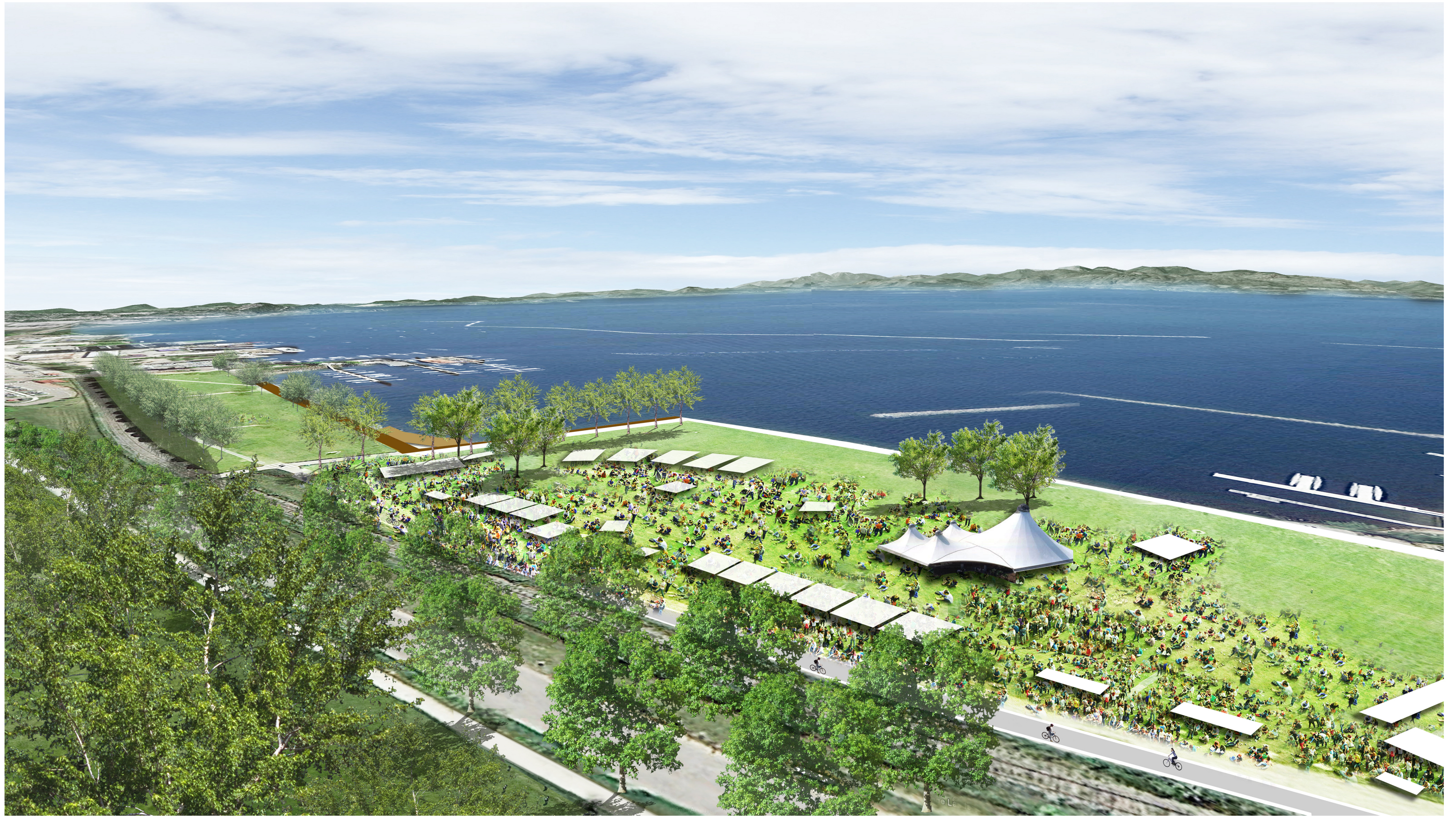
WATERFRONT PIAP PROJECT PROPOSAL WATERFRONT PARK UPGRADES View looking south at Event Grounds